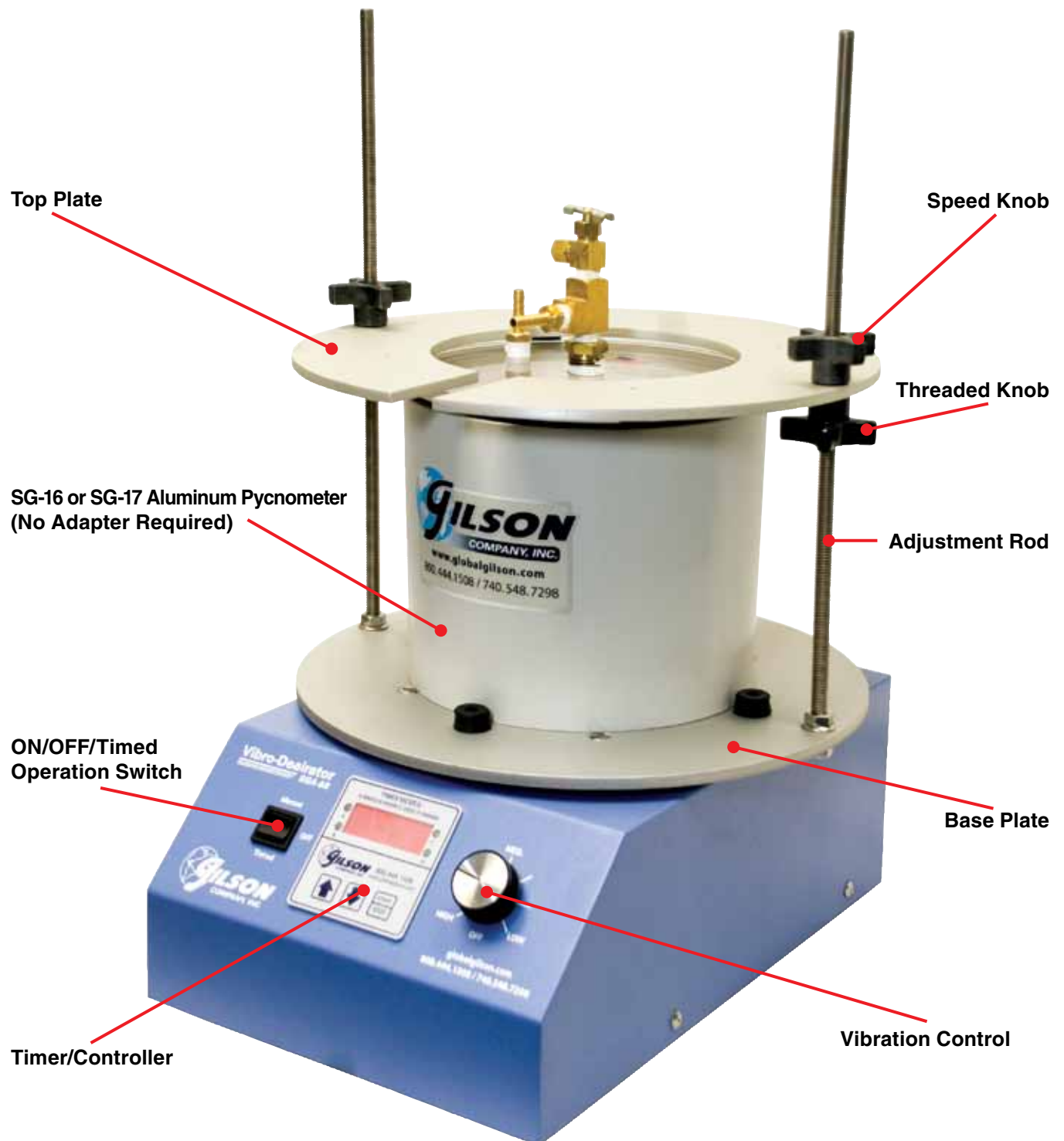
Figure 2 Using SG-16 or SG-17 Aluminum Pycnometer