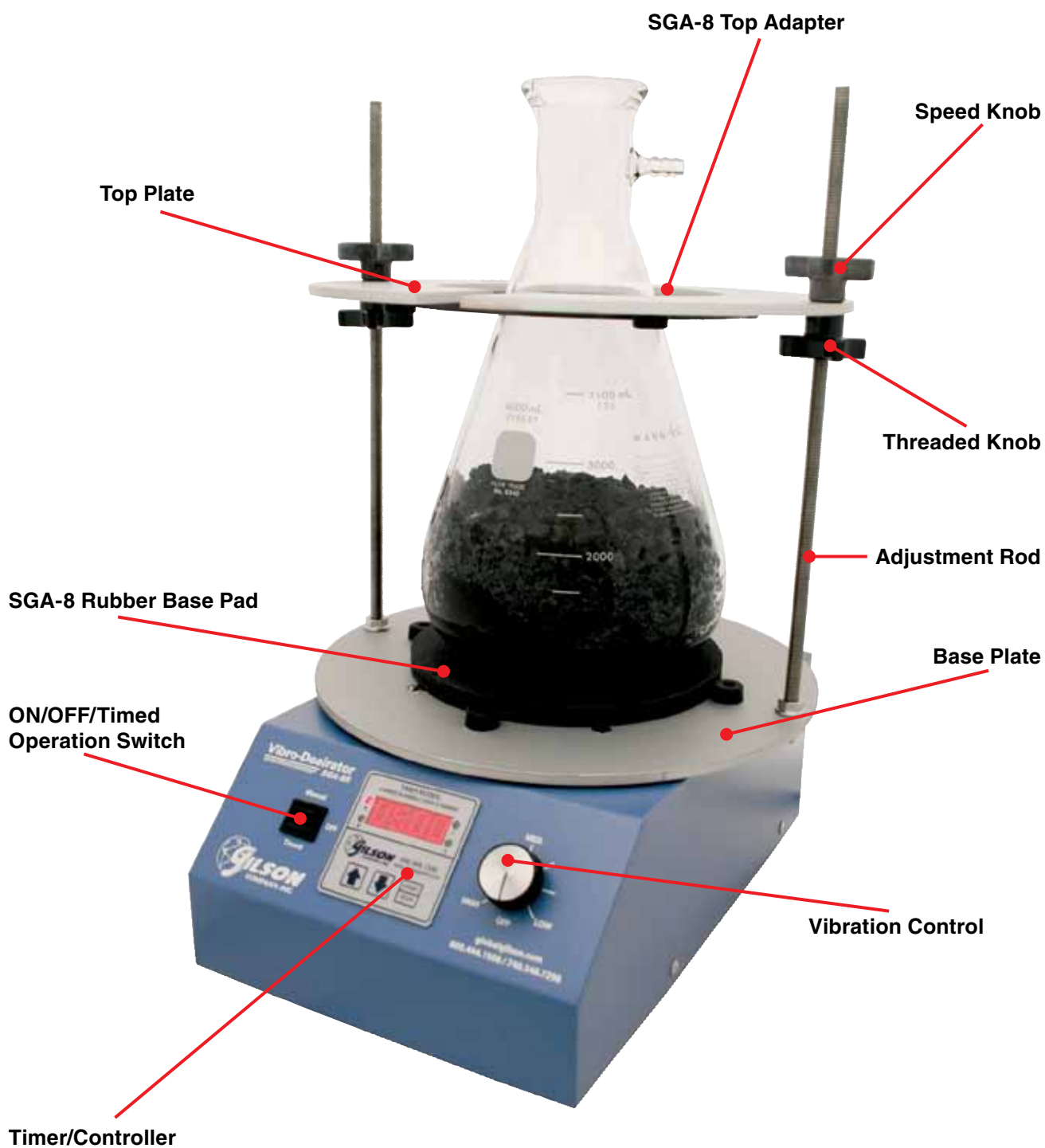
Figure 1 Using GW-75 or GW-76 Glass Filter Flasks