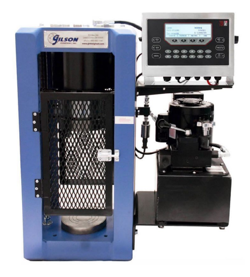
250 Series Concrete Compression Machine with Pro Controller