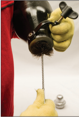
STEP 1: Cleaning residue from Vessel