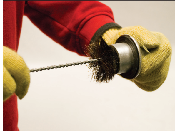
STEP 1: Cleaning residue from chamber cap