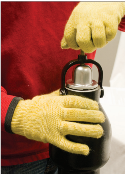
STEP 9: Loosening top screw to vent pressurized gas

9 STEP 9. Taking great care that the black dot on the chamber cap is facing away from your face and body, slowly loosen the top screw to vent pressurized gas from the vessel.