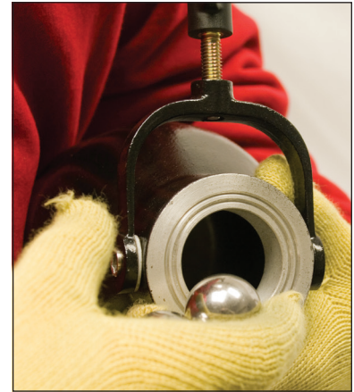
STEP 4: Placing Steel Pulverizing Balls into Vessel