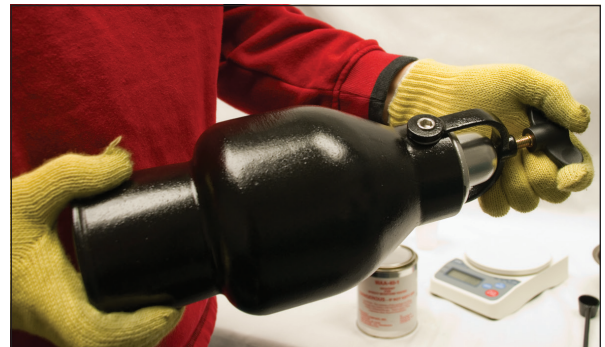
STEP 6: Tightening the top screw to seal the chamber