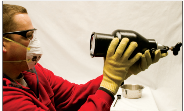
STEP 8: Reading the pressure gauge at eye level