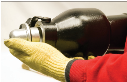
STEP 6: Placing chamber cap on the end of the chamber