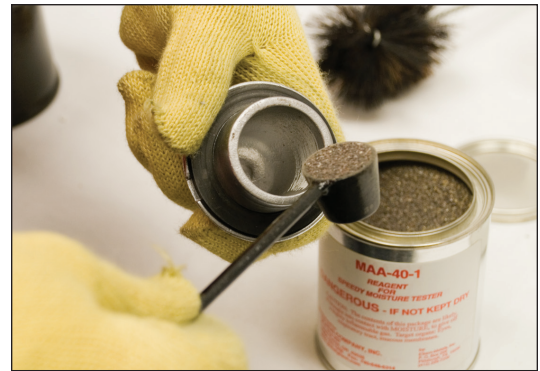
STEP 5: Adding calcium carbide reagent to chamber cap

NOTE: Make sure you have read and understand the Material Safety Data Sheet (MSDS) included with each container of calcium carbide reagent.