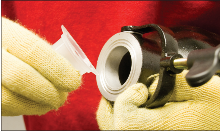
STEP 4: Placing sample into Vessel