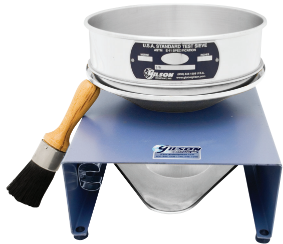
SSA-802 shown with Test Sieve