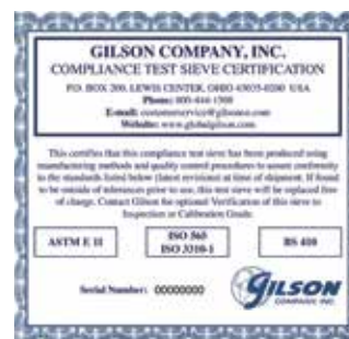
Certificate of E 11 Compliance for all Sieves