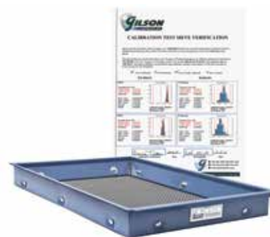
GV-66 Calibration Verification shown with Screen Tray