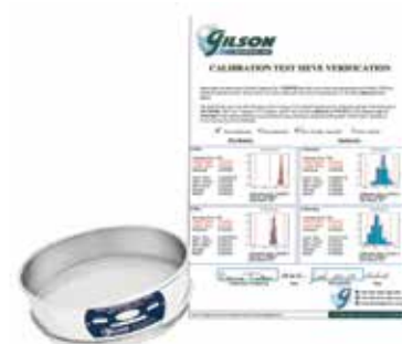
GV-65 Calibration Verification shown with Sieve

All Gilson test sieves meet ASTM or ISO requirements for Compliance Test Sieves. Ordering additional verification services for each individual sieve upgrades them to meet Inspection or Calibration specifications.