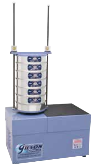
SS-8R Gilson Tapping Sieve Shaker shown with Sieves