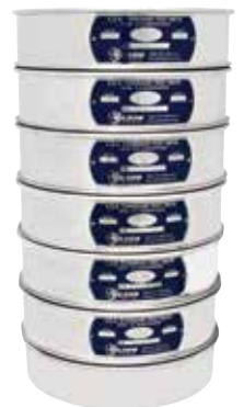
8in Stainless Steel Test Sieves