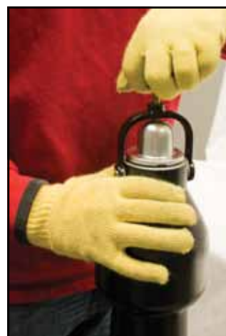
Step 9: Loosening top screw to vent pressurized gas

Step 9. Taking great care that the black dot on the chamber cap is facing away from your face and body, slowly loosen the top screw to vent pressurized gas from the vessel.