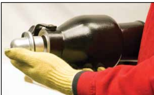
Step 6: Placing Chamber Cap on the end of the chamber

Step 6. Holding the Aqua-Check vessel horizontally, place the chamber cap on the end of the chamber. Position the black dot on the cap so that it will be facing away from your body when the pressure is released. Move the stirrup into place over the cap and tighten the top screw to seal the chamber. Use care during this step not to mix the reagent and sample before the chamber is sealed.