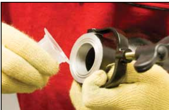
Step 4: Placing sample into vessel

Step 4. Place the prepared and weighed sample into the Aqua-Check vessel. For cohesive samples as described above, also place the two steel pulverizing balls into the vessel.