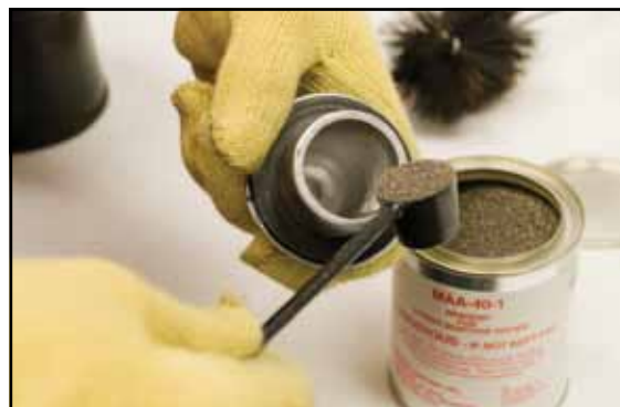
Step 5: Adding calcium carbide reagent to Chamber Cap

NOTE: Make sure you have read and understand the Material Safety Data Sheet (MSDS) included with each container of calcium carbide reagent.