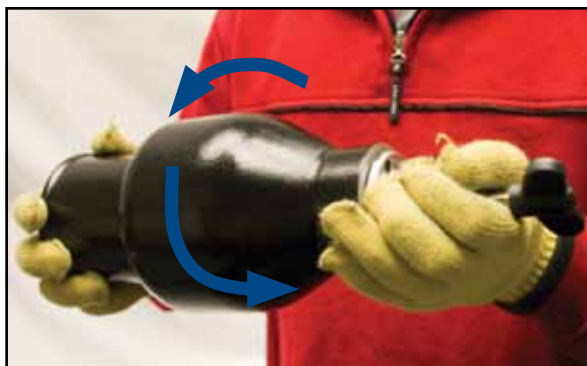
Step 7b: Using an orbital motion to spin the balls around inside the chamber

Step 8. Read the pressure gauge at eye level while holding the vessel horizontally. Wait for the indicator needle to stop moving. The gauge reads directly in percent water content of wet weight. Accuracy may be improved by establishing a correction chart as shown in ASTM D 4944.