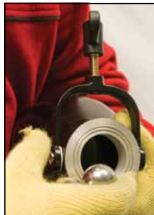
Step 4: Placing steel Pulverizing Balls into vessel

Step 5. Using the Long-Handled reagent Scoop, add at least two full scoops of calcium carbide reagent to the Chamber Cap.