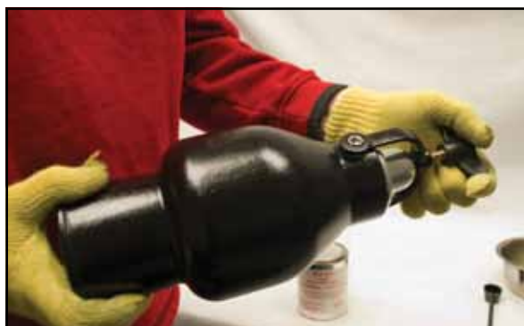
Step 6: Tightening the top screw to seal the chamber