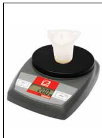
Step 3: Sample material at 20g

NOTE: If the moisture content of the material is expected to exceed 20%, a 10g sample should be used, but the value read on the gauge must then be doubled. It is also possible to obtain better resolution of drier materials (<10%) by doubling the sample size and halving the gauge reading.