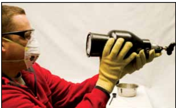
Step 8: Reading the pressure gauge at eye level

Step 8. Read the pressure gauge at eye level while holding the vessel horizontally. Wait for the indicator needle to stop moving. The gauge reads directly in percent water content of wet weight. Accuracy may be improved by establishing a correction chart as shown in ASTM D 4944.