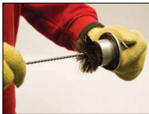
Step 1: Cleaning residue from Chamber Cap

Step 2. Select a representative sample of the test material. Cohesive materials that do not readily separate into individual particles, such as clay or silt soils, should be reduced by hand into small clumps.