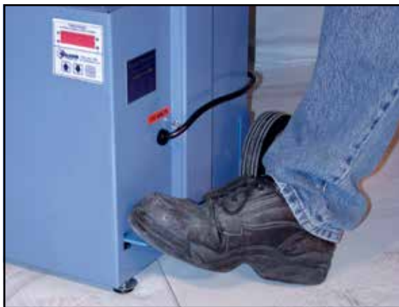
Porta-Screen® has Foot-Tab leveling.