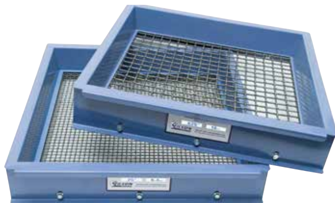
Porta-Screen® Tray cloth has metal shields to eliminate partial openings.

PSA-114 Porta Wheels may be attached for added mobility. Ball-bearing wheel assemblies with rubber tires are pre drilled for quick attachment to frame of Porta-Screen®.