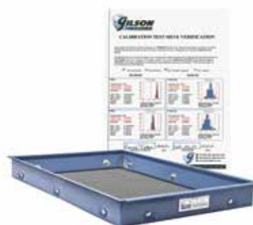
GV-66 Calibration Verification shown with Screen Tray