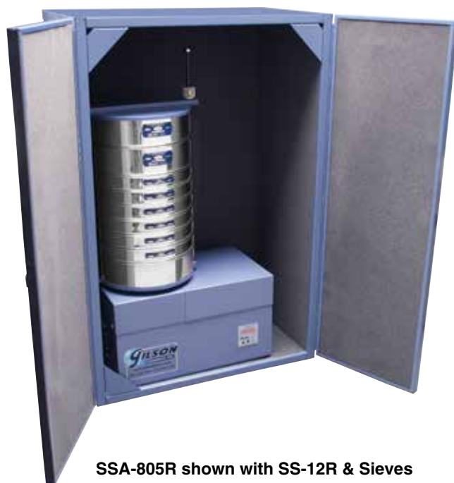
SSA-805R shown with SS-12R &amp; Sieves