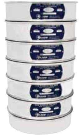
8in Round Test Sieves