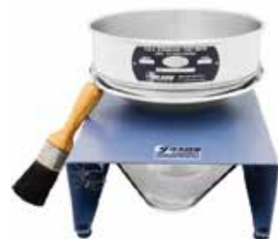
SSA-802 shown with Sieve