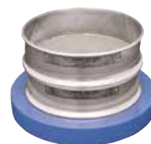
SSA-811 shown with Sieves