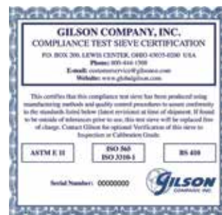
Certificate of E 11 Compliance for all Sieves