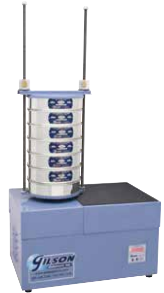
SS-8R Gilson Tapping Sieve Shaker shown with Sieves