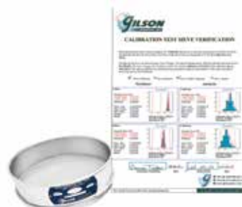
GV-65 Calibration Verification shown with Sieve

All Gilson test sieves meet ASTM or ISO requirements for Compliance Test Sieves. Ordering additional verification services for each individual sieve upgrades them to meet Inspection or Calibration specifications.