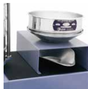
SSA-801 shown with Sieves on SS-8R