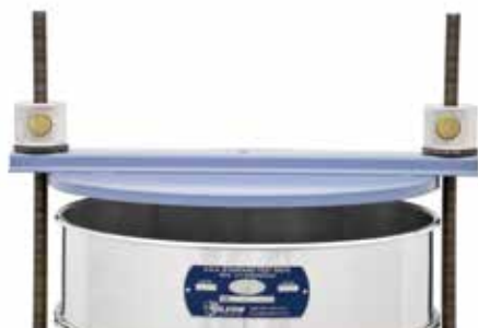
SSA-809 shown on SS-12R with Sieves