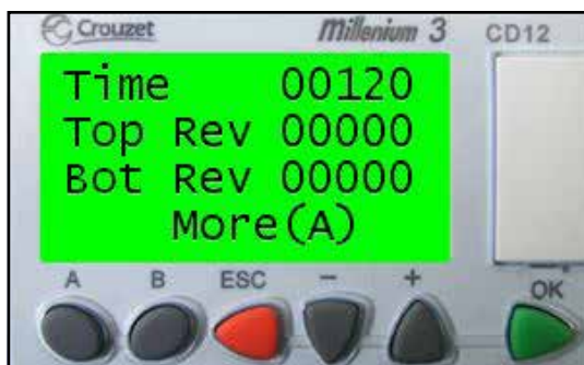
Timer Mode Screen

RPM Screen: Displayed when <A> is pressed from either the Timer Mode or Counter Mode screens. Revolutions counted during the last full minute are shown. Display is updated every minute and must complete one minute before the first reading is displayed. To go to the 'Elapsed Time' screen press <A>. Pressing <B> returns you to the current mode screen.