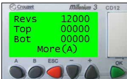
Revolutions Mode Screen

NOTE: Pressing the large, red <STOP> button located on the front panel will cut power to the motor and rotation will cease. Depressing the <START> button will resume operation and reset the controller.