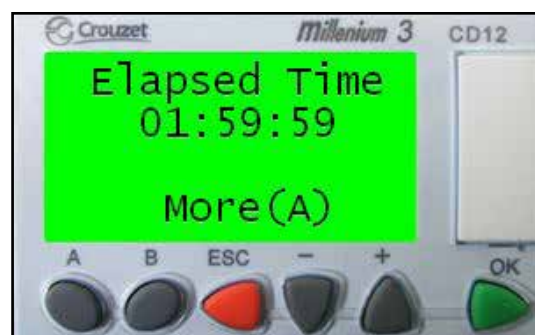
Elapsed Time Screen