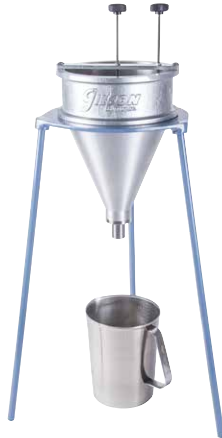
HM-372 Flow Cone Set shown with MA-48 Beaker

HM-371 Grout Flow Cone w/No Orifice does not include an Orifice to regulate flow. It can be fitted with the HMA-146 0.5in Orifice for ASTM testing, or the HMA-147 0.75in Orifice for other methods. Orifices are purchased separately.