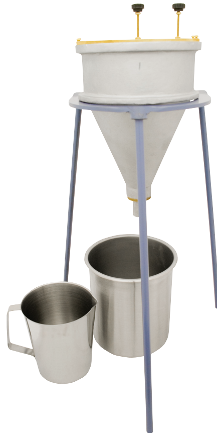
HM-372A shown with HM-372 Flow Cone Set and MA-48 Stainless Steel Beaker